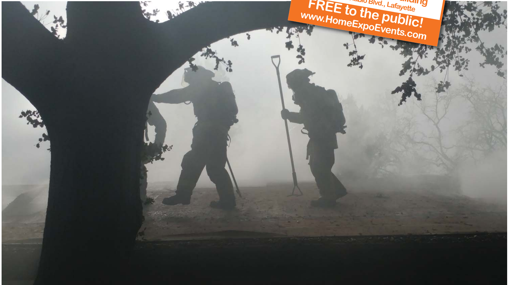
Firefighter recruits from Academy 51 break through the roof of Fire Station 16 in Lafayette during Jan. 12 training exercise.